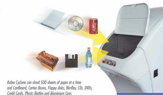
Kobra Cyclone can shred 500 sheets of paper at a time and Cardboard, Carton Boxes, Floppy disks, Blu-Ray, CDs, DVDs, Credit Cards, Plastic Bottles and Aluminium Cans

Kobra Cyclone is equipped with a turbine generating a high pressure air flow and sets of high speed rotating blades. By making the air stream spin, particles are subjected to centrifugal forces and deposited from the air flow into the disposal bag. This unique shredding system, delivers the highest shredding performance and efficiency along with maximum flexibility in choosing the correct Security and bulk reduction Level for a given application. Cyclone does not require the special maintenance and complicated oiling procedures that other machines with similar output rates do. Cyclone is designed for high volume shredding and maintenance free operation.