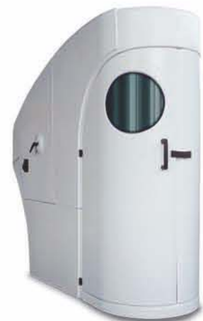
Rear window for easy checking of waste bag level

The Kobra Compactor model C-500 is designed to work with the Cyclone industrial shredder when paper is being shredded. When shredding other materials, you simply remove the compactor and use standard Cyclone disposal bags. This optional accessory compresses and reduces the volume of the shredded paper by 4 to 5 times to minimize the space required for disposal. Easy to install and operate, the Kobra Compactor C-500 will work with any Cyclone security level screen. Compacted shredded paper can be collected into any type of container or into plastic waste bags.