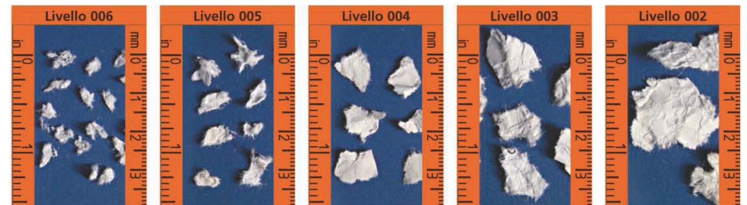
Livello 006 High Security shredding for very classified documents. Military and Government use. Similar to Level 6 Security Level DIN 32757. Maximum bulk reduction of shredded material. Shredding output 70-80 Kg. (155-180 lbs) per hour (Theoretical Output) Livello 005 High Security, suitable for Embassies, Military and Government offices. Similar to Level 5 Security Level DIN 32757. Very high bulk reduction of shredded material. Shredding output 100-120 Kg. (225-265 lbs) per hour (Theoretical Output) Livello 004 Security Level suitable for destruction of classified documents. Similar to Level 4 Security Level DIN 32757. Increased bulk reduction of shredded material. Shredding output 200-230 Kg. (445-500 lbs) per hour (Theoretical Output) Livello 003 This Security Level is suggested for most common commercial shredding jobs. Similar to Level 3 Security Level DIN 32757. Combines an excellent degree of security, bulk reduction of shredded material and shredding output. Shredding output 300-320 Kg. (670-715 lbs) per hour (Theoretical Output) Livello 002 Low degree of bulk reduction of shredded paper. Shredding output 400-420 Kg. (900-940 lbs) per hour (Theoretical Output)

5 different Security Levels are available with the Kobra Cyclone. It is possible to switch the machine to any of the available Security Levels by a simple modification which takes only a few minutes. This unique feature allows the Cyclone to produce the output particles which meet the requirements of the most demanding applications in terms of bulk reduction, shredding speed and security. The highest Security Level (Level 006) sets the machine for high security shredding, maximum bulk reduction of shredded material and minimum shredding output per hour. At the other end of the spectrum the lowest Security Level sets the machine for minimum bulk reduction of shredded material and maximum shredding output per hour. Shredding capacity of the Kobra Cyclone will remain at 500 sheets regardless of the Security Level installed. The following chart is a helpful guide for choosing the correct set up on the Kobra Cyclone and it shows with a 1:1 ratio the available Security Levels and the suggested use of each Level according to shredding output per hour.