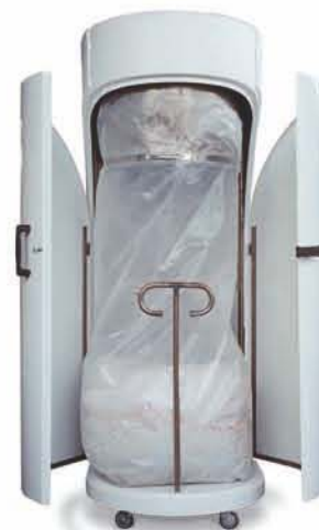
Kobra CYCLONE (standard version) Kobra Cyclone utilizes a plastic waste bag to store shredded materials in an internal storage compartment. Full bags are easily removed and disposed of assisted by the built-in-trolley