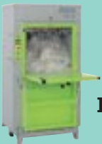
DIXI 10 S

Compaction force 6 t Bale weight 40-60 kg