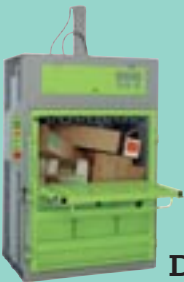
DIXI 25, 30 S

Compaction force 8,5 t Bale weight 50-80 kg