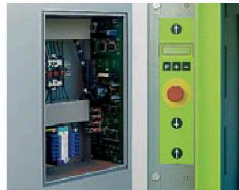
Low maintenance: the micro processor control