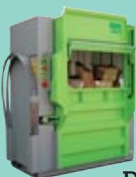
DIXI 60, 80 S

Compaction force 25-30 t Bale weight 250-360 kg