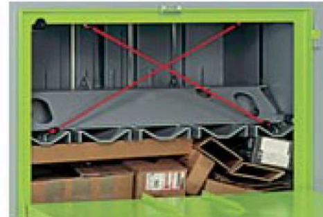
Robust: The twofold guided press ram