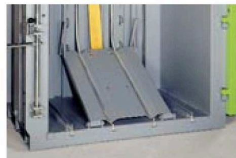
Easy to operate: The ejector