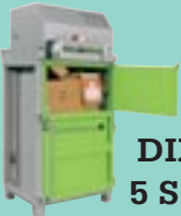
DIXI 5 S-K

Compaction force 4 t Bale weight 30-50 kg