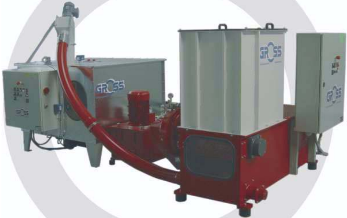
GAZ 62 with briquetting press GP