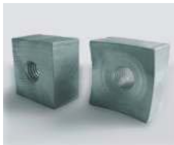
Square knife and concave ground knife