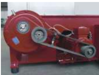
Transmission and motor

Material is fed through the hopper in front of a hydraulically operated drawer, which pushes the material load-controlled onto the turning rotor. The material is shredded between the rotor knives and a fixed counterknife. The drawer has strip-ping bars that prevent material from entering between the drawer and machine housing. The screen hole with different perforation diameters determines the size of clippings or shavings. Produced shavings can be removed from the machine with the suction device or spiral conveyor. Once the material is shredded, the machine will automatically shut off.