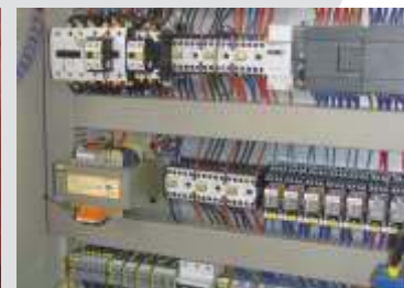
Switching cabinet / SPS control