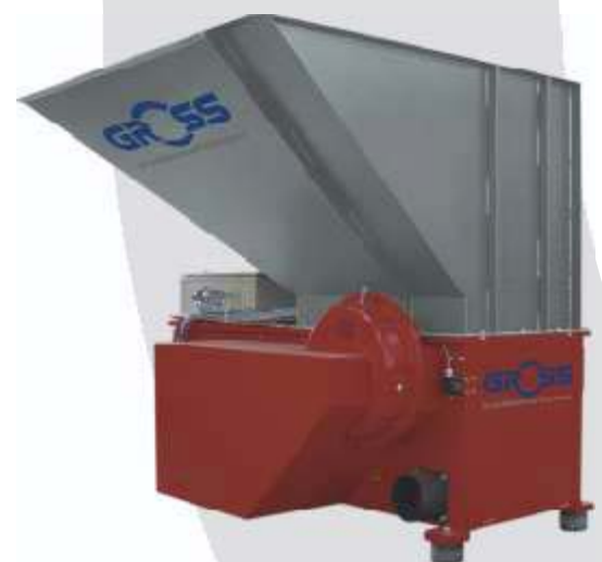
GAZ 62 with customer specific hopper