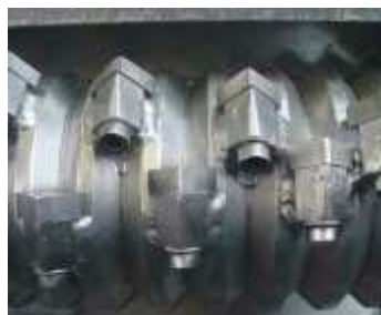
Profile rotor with welded knife carriers (GAZ 62 S)