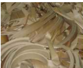
Waste from furniture manufacturing