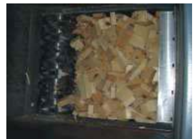
Hopper, filled with material