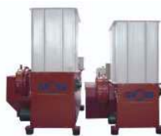
GAZ 62 S GAZ 62

The robust GAZ 62 series valuable substance shredders shred materials such as wood, cardboard, plastic and many others economically and effectively. The shredders can be adjusted according to customer specific requirements for throughput volume, material to be processed, etc. The GAZ 62 series shredders are compact and designed for high performance.