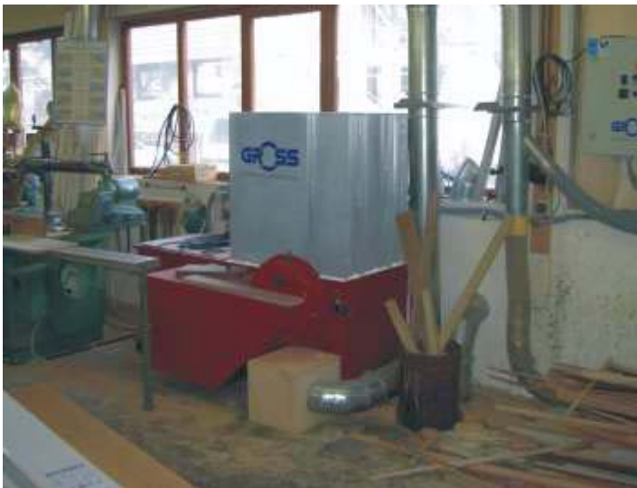
GAZ 62 used at a joiner's woodshop