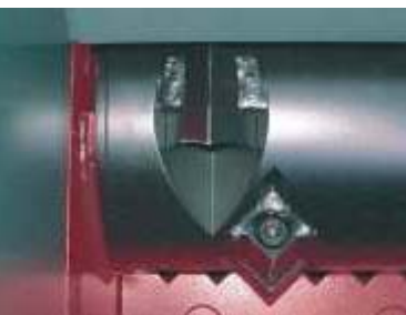
Flat rotor (GAZ 62 E)